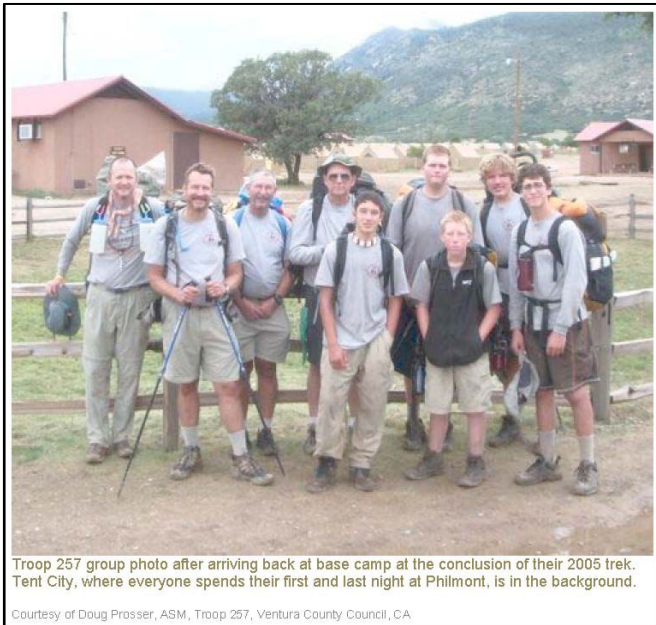
Troop 257 group photo after arriving back at base camp at the conclusion of their 2005 trek. Tent City, where everyone spends their first and last night at Philmont, is in the background.

I carry my small pocketknife, whistle, and a couple of photon lights on a necklace so I know where everything is when I need it. The other personal gear you will need is a plastic bowl, cup for hot liquids and a spoon for eating. Some other items are a small propane lighter, personal first aid kit, medicines, sunglasses, and a "stash" of coffee if you are a big coffee drinker. If you really need your caffeine, chocolate-coated coffee beans were really popular on our 2002 and 2005 treks. Remember to bring two cotton bandanas, one for cooking with and one for personal needs.