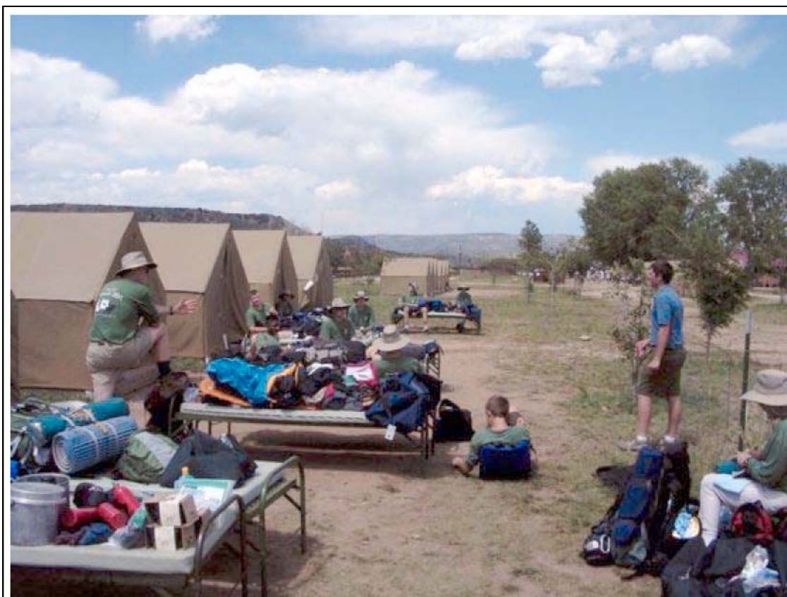
Equipment check on day one, Philmont 2004.