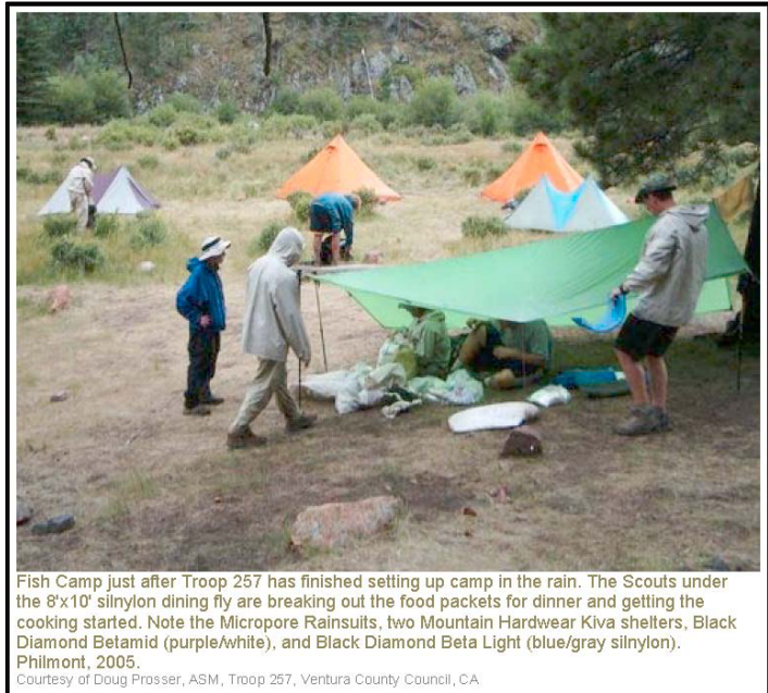
Fish Camp just after Troop 257 has finished setting up camp in the rain. The Scouts under the 8'x10' silnylon dining fly are breaking out the food packets for dinner and getting the cooking started. Note the Micropore Rainsuits, two Mountain Hardwear Kiva shelters, Black Diamond Betamid (purple/white), and Black Diamond Beta Light (blue/gray silnylon). Philmont, 2005.

Philmont also provides Katadyn Micropur water purification tablets, a variety of other cleaning equipment, and bear bags and ropes. Philmont uses a plastic strainer to filter food particles out of wash water and drain it into an underground sump. A spatula is used to scoop the larger food particles from the strainer to